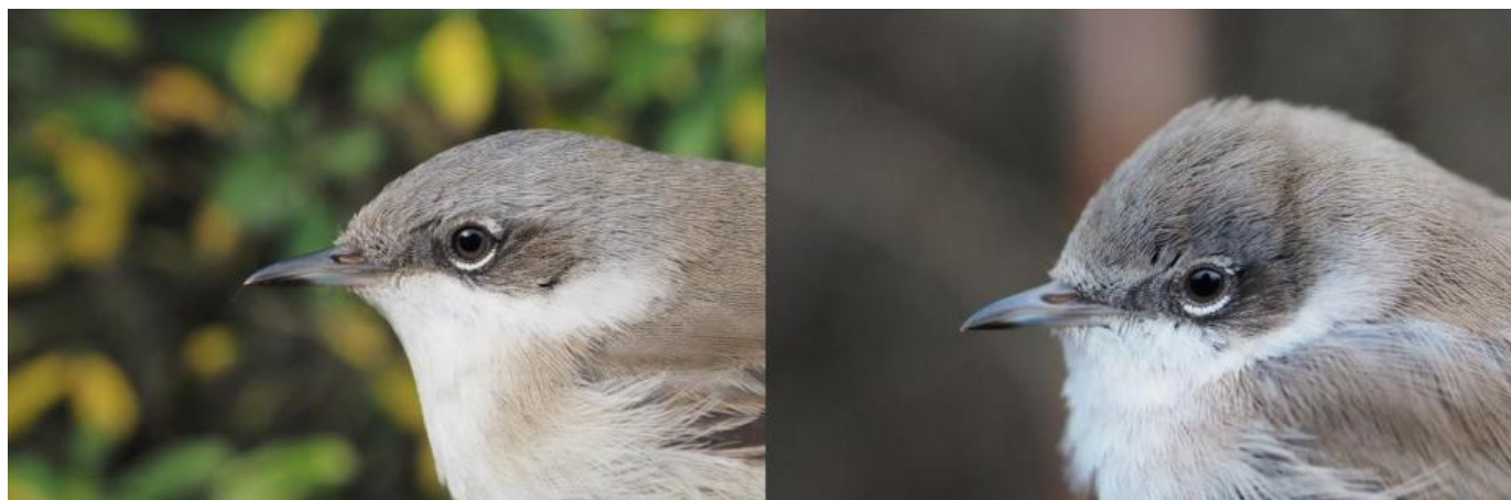
De to sibiriske gærdesangere ssp. blythi fra Skagen ultimo oktober 2019.

The Observatory has now received the interesting answer of the tests. The results showed for both individuals to be ssp. blythi (Siberian Lesser Whitethroat). Below a cladogram of the different Lesser Whitethroat subspecies, with the two individuals from Skagen.